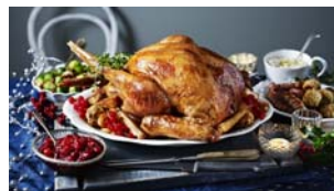
Raymond Blanc's roast turkey